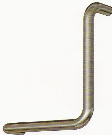
SLS809 "L Shaped"