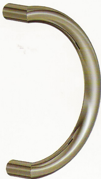
SLS811 "Mitred Semi Circle"