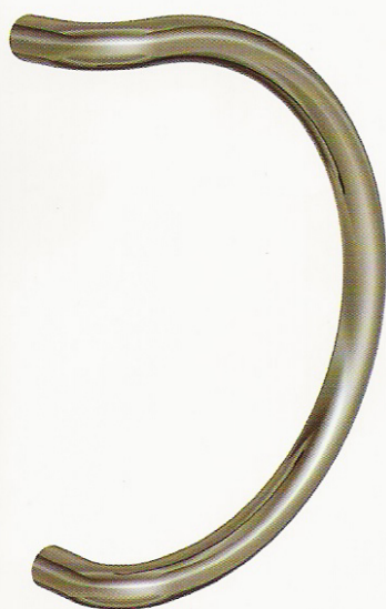
SLS810 "Semi Circle"